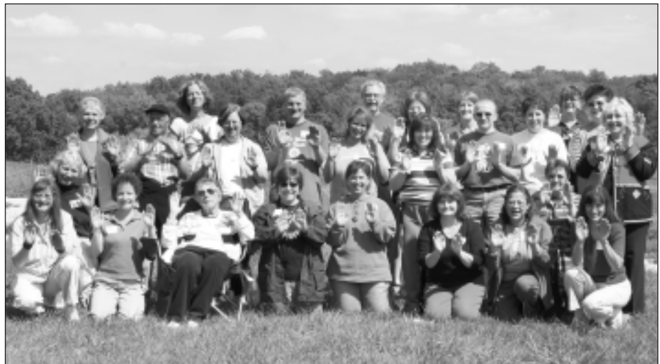
Reiki Renewal Day participants beam Reiki. Feel the energy!

Attunements, group Reiki en pleine aire and Reiki for animals